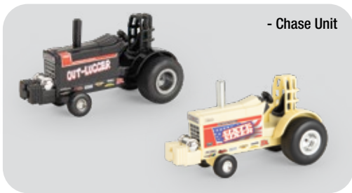
- Chase Unit