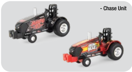
- Chase Unit